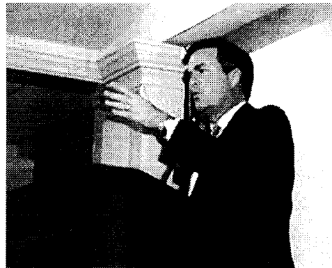
Florida Governor Jeb Bush

Bush said the choice program is realizing its intended effect of sparking genuine school improvement in the schools that have failed as well as in those in danger of failing. In Broward County, for example, officials have lowered the first-grade class size in the 104 at-risk schools. In Jacksonville, officials have introduced summer and after-