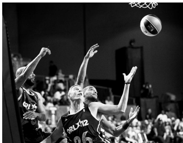
U.S. Education Secretary Arne Duncan stays low in the 2012 Sprint NBA All-Star Celebrity Game.